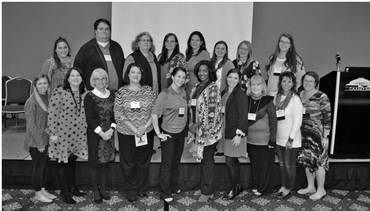
2020 LACEC Board Members