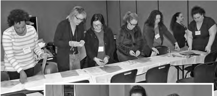
Make and Take Sessions